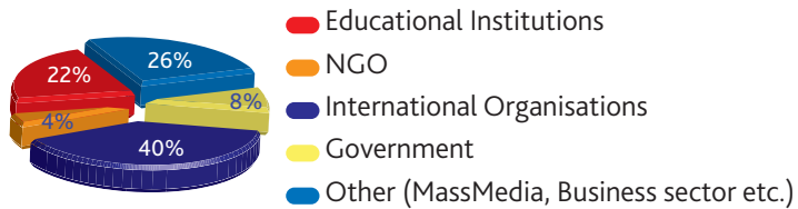
Employment of the OSCE Academy's Alumni

The OSCE Academy alumni network is designed to support the graduates in their professional and academic aspirations and should contribute to a stronger integration of young professionals in Central Asia and beyond.