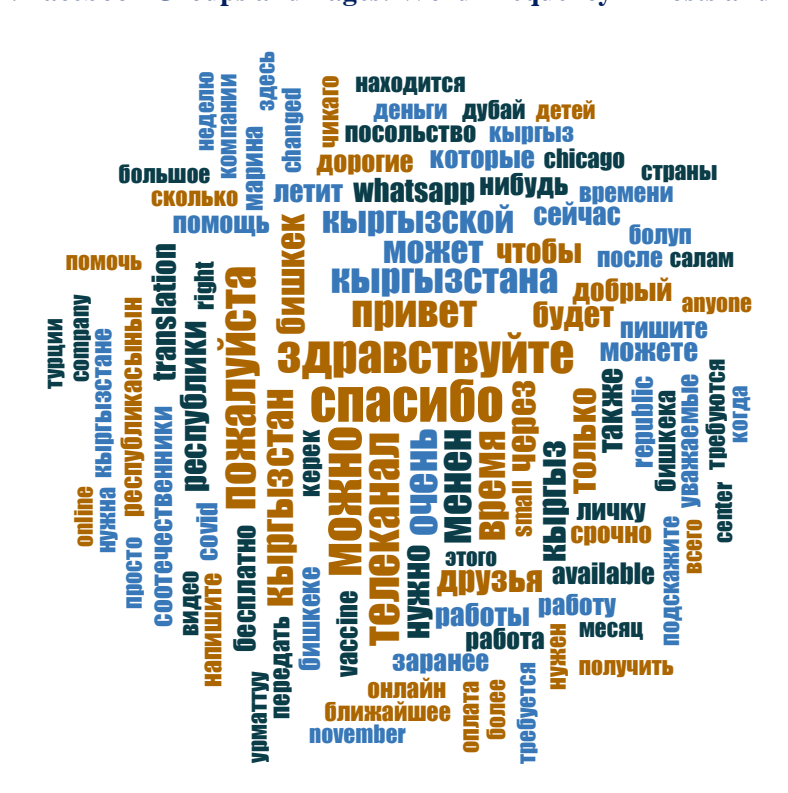
Figure 1. Facebook Groups and Pages: Word Frequency in Posts and Comments

35 Rajiv George Aricat, "Mobile/Social Media Use for Political Purposes Among Migrant Laborers in Singapore," Journal of Information Technology & Politics 12, No. 1 (2015): 18-36.; Rianne Dekker and Godfried Engbersen, "How Social Media Transform Migrant Networks and Facilitate Migration," Global Networks 14, No. 4 (2014): 401-418.; Vanessa Ruget and Burul Usmanalieva. "Can Smartphones Empower Labour Migrants? The Case of Kyrgyzstani Migrants in Russia," Central Asian Survey 38, No. 2 (2019): 165-180.